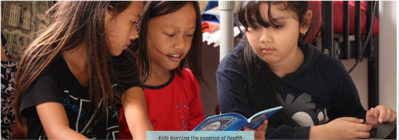
Kids learning the essence of health