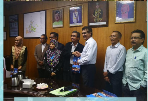
IRM delegation visited the project site in sabah