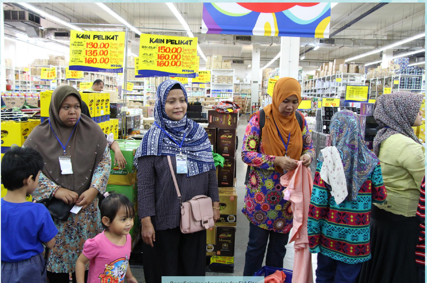
Beneficiaries shopping for Eid Fitr

For information, all beneficiaries involved are from Projek Perumahan Rakyat (PPR) Lembah Subang and PPR Kota Damansara respectively.