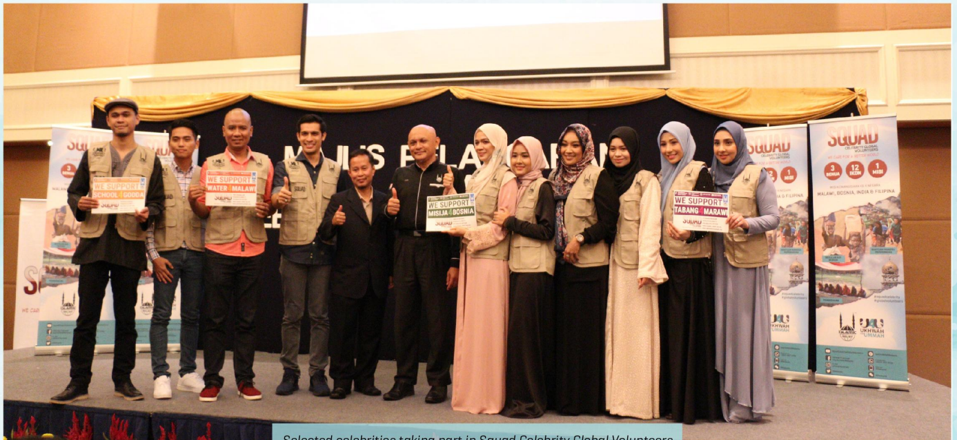
Selected celebrities taking part in Squad Celebrity Global Volunteers

Islamic Relief Malaysia (IRM) and Ukhwah 4 Ummah (U4U) launched a humanitarian mission namely Squad Celebrity Global Volunteers Project and worked together alongside local celebrities.