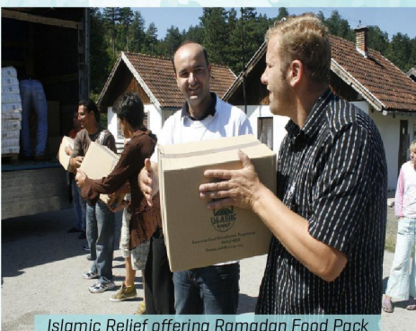
Islamic Relief offering Ramadan Food Pack Distribution in Bosnia & Herzegovina

We allocate these resources regardless of race, political affiliation, age, gender, abilities or belief, and without expecting anything in return.