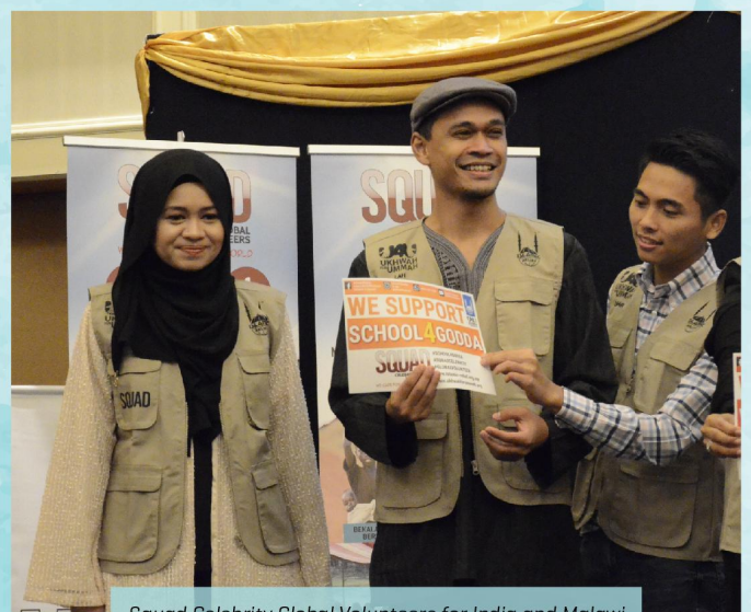
Squad Celebrity Global Volunteers for India and Malawi

As in line with the vision of IRM in an effort to create a caring world, IRM worked together with U4U alongside 12 local celebrities in understanding the hardships and difficulties experienced by those beneficiaries in four countries while being able to deliver humanitarian messages back to the community.