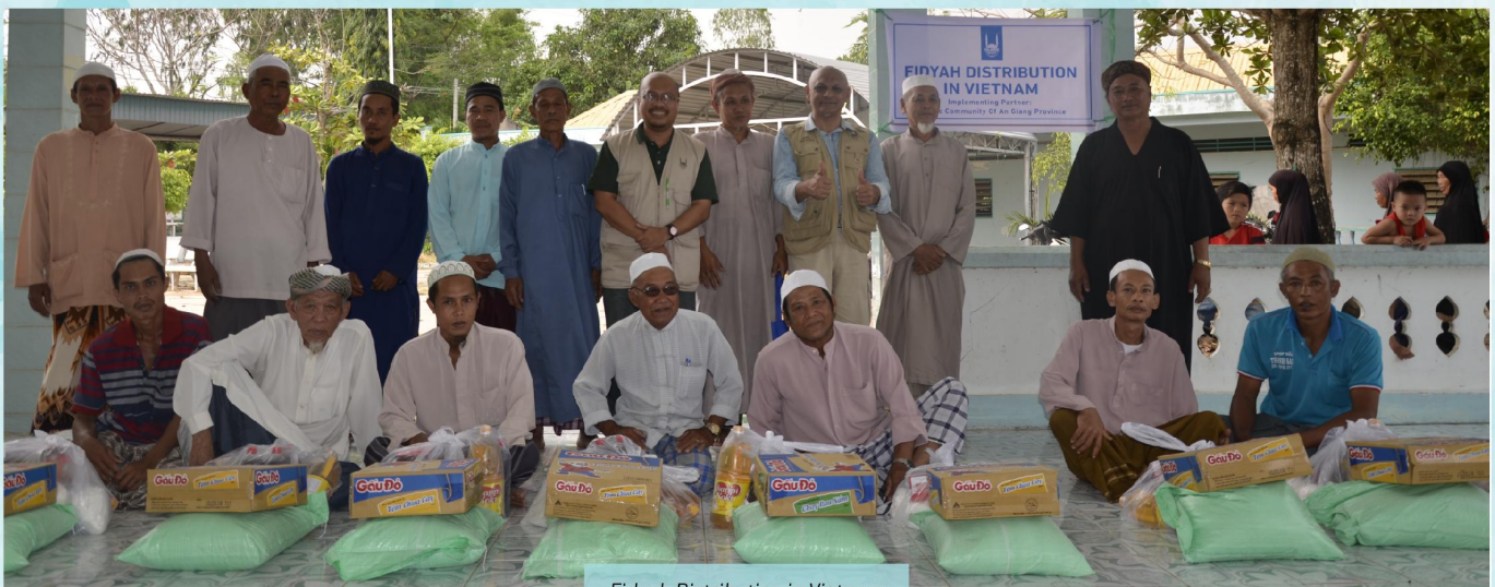
Fidyah Distribution in Vietnam