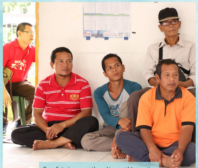
Beneficiaries are gathered in monthly meeting

Community Development Project is an initiative by IRM to develop a community through a multitude of sectors namely sustainable livelihood, health, education and shelters, as well as to improve the socio-economic level in a community.