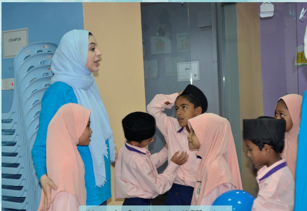
Volunteers from Canada interacting with RISE students