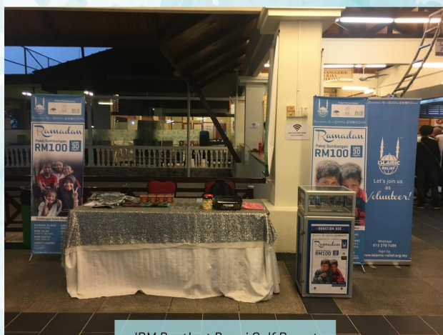
IRM Booth at Bangi Golf Resort