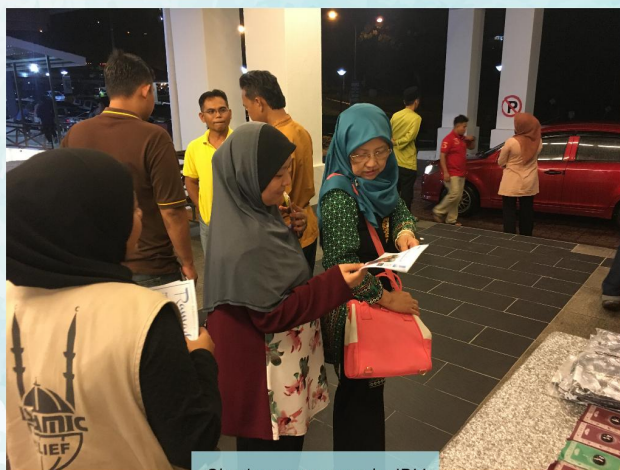
Sharing awareness by IRM

Through the campaign, IRM also aims to build networks and expect to have more donors in the future.