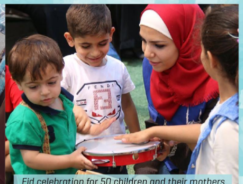
Eid celebration for 50 children and their mothers by Islamic Relief Jordan